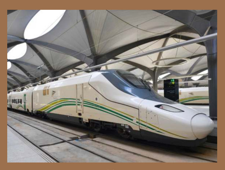
MEDINA TO MECCA OR MECCA TO MEDINA haramain high speed Train included

Give yourself a higher level of comfort and relaxation in our premium VIP tents 12 persons in a tent size 4x4 meters (2 tents may combine)