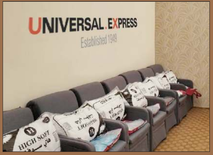
UPGRADE TO PREMIUM VIP SAR 5,000