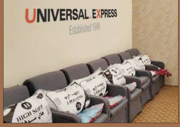
UPGRADE TO PREMIUM VIP SAR 5,000

MEDINA TO MECCA OR MECCA TO MEDINA haramain high speed Train included