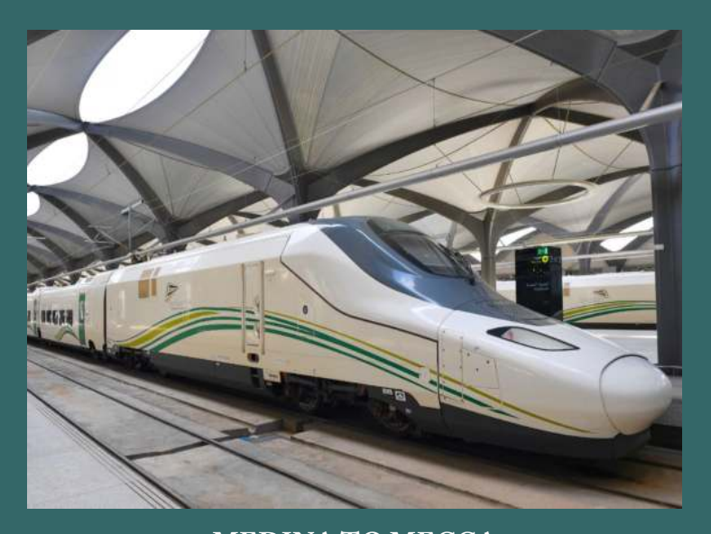
MEDINA TO MECCA OR MECCA TO MEDINA haramain high speed Train included

Give yourself a higher level of comfort and relaxation in our premium VIP tents 12 persons in a tent size 4x4 meters (2 tents may combine)