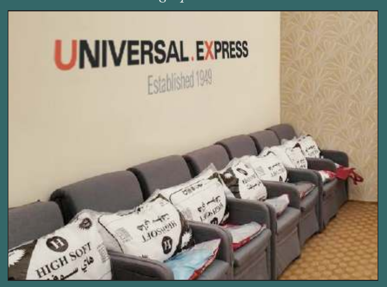
UPGRADE TO PREMIUM VIP SAR 5,000