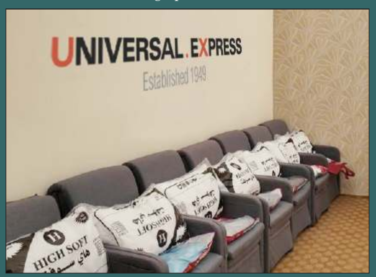
UPGRADE TO PREMIUM VIP SAR 5,000