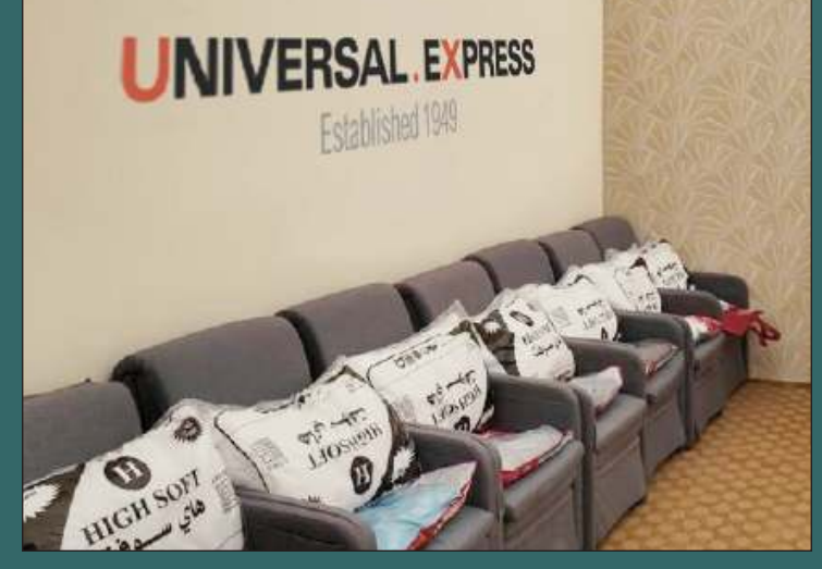
UPGRADE TO PREMIUM VIP SAR 5,000

MEDINA TO MECCA OR MECCA TO MEDINA haramain high speed Train included